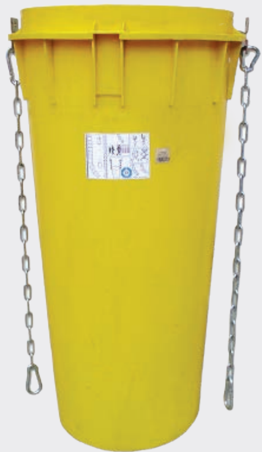
35600 Chute, Base part 9 kg