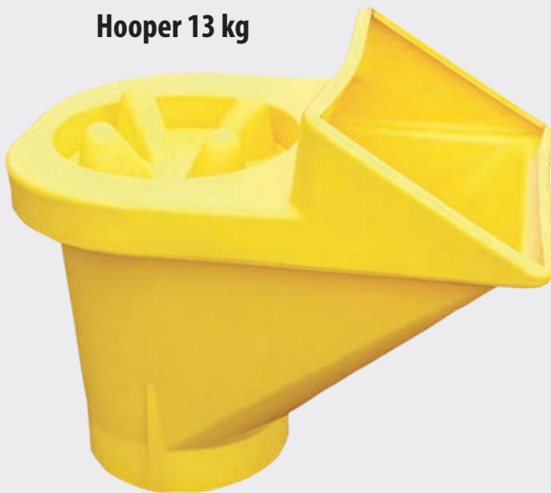
35601 Hooper 13 kg